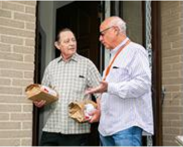
MEALS ON WHEELS