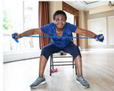
EXERCISE & FALLS PREVENTION CLASSES