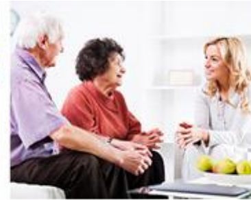
HOLOCAUST SURVIVOR SERVICES