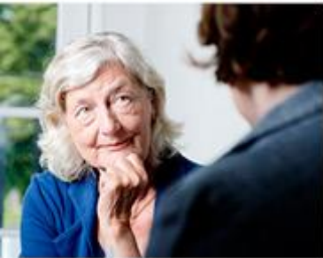
FAMILY CAREGIVER CONNECTIONS