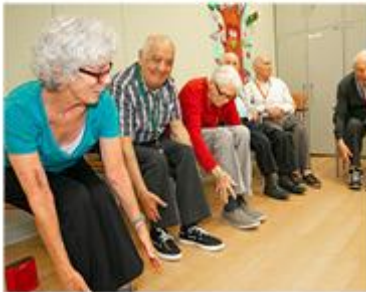
ADULT DAY PROGRAM FOR SENIORS WITH DEMENTIA