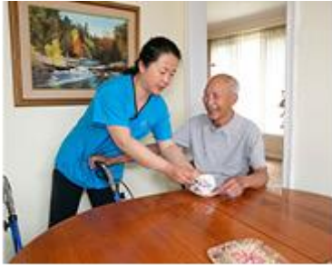
HOME SUPPORT SERVICES